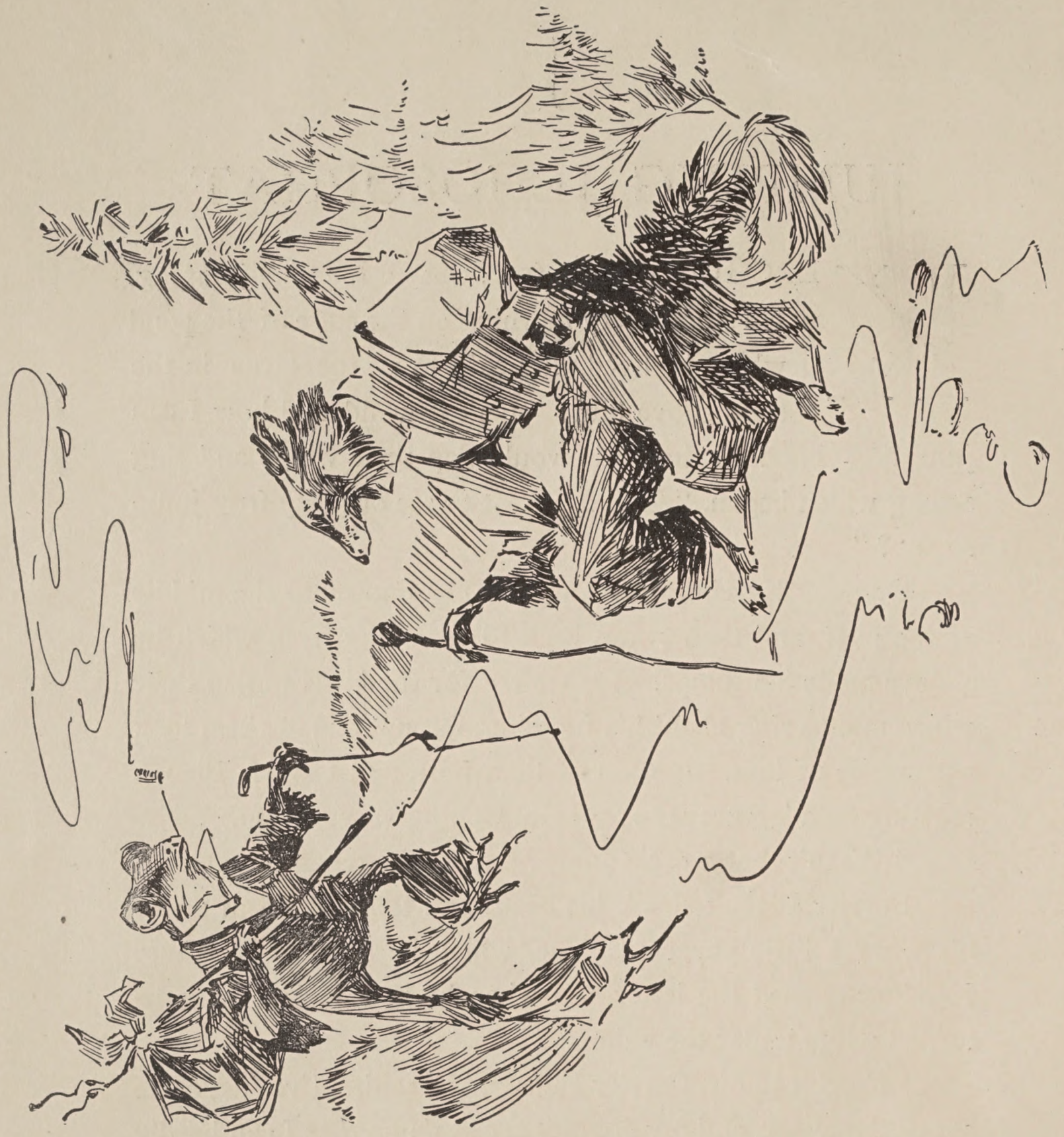
SLY FOX STOPS KERCHUG FROM RUNNING AWAY.